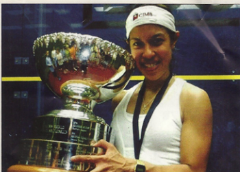
Giant killer Nicol David poses with her trophy