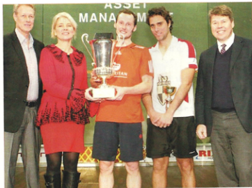
Gregory Gaultier and Karim Darwish with their trophies

A high quality performance by top seed Gregory Gaultier saw the Frenchman win the Case Swedish Open title and notch up the 20th PSA World Tour title of his career at the long-established PSA International 70 squash event at the Linköping Sporthall in Linköping.