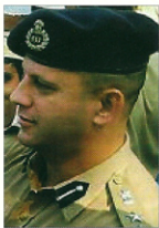
Late Mr. Ashok Kamte