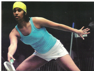
Joshna Chinappa in action