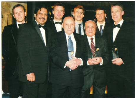
Great Players: Left to Right: Peter Nicol, Jahangir Khan, Lee Beachill, Hashim Khan, Nick Matthew, Azam Khan, Anthony Ricketts, Geoff Hunt

Squash legends Hashim Khan, Geoff Hunt and Azam Khan have been honoured with Lifetime Achievement Awards at the World Squash Awards in Manchester, UK