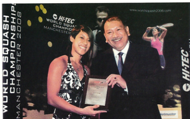
Nicol David receives WISPA Player of the Year Award from HRH Prince Tunku Imran, Patron of the WSF

Awards host Peter Nicol was delighted with the success of the event: "On behalf of Eventis, we would like to thank Geoff Hunt, Azam Khan and Hashim Khan for making the journey to Manchester to be at the 2008 World Squash Awards and for making the evening so memorable. Jahangir Khan's final evening as the WSF President was also observed and a tribute to all his hard work over the years was greeted with a standing ovation. This truly was a unique occasion for all squash fans as we had several generations of World Champions present and few future ones sitting at the tables watching on.