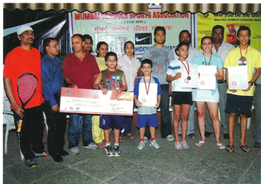
All winners along with the officials of MSSA and Indian Squash Professionals

Organised by Mumbai School Sports Association and conducted by Indian Squash Professionals at Bombay Gymkhana, this year's event attracted a record number of 225 entries. However, there were a few problems that emerged due to receiving the entries just two days before the start date of the event, additional entries being sent to ISP from MSSA after making of draws, but accommodated as the draw had not been displayed.