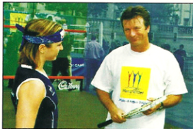
Aussie power: Aussie squash queen Sarah Fitz-Gerald with cricket icon Steve Waugh at Trafalgar Square.

A squash battle was enacted at Trafalgar the other day. Steve Waugh captain of the Invincible Australian cricket squad played squash with queen Sarah Fitz-Gerald at London's famous landmark.